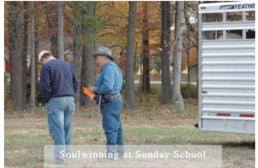
Soulwinning at Sunday School