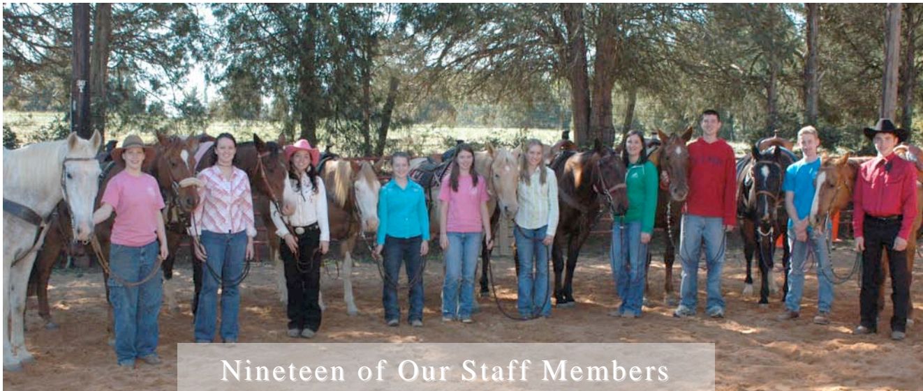
Nineteen of Our Staff Members