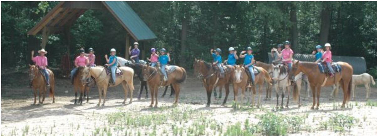
Wranglers and riders ready to go on the trail at camp