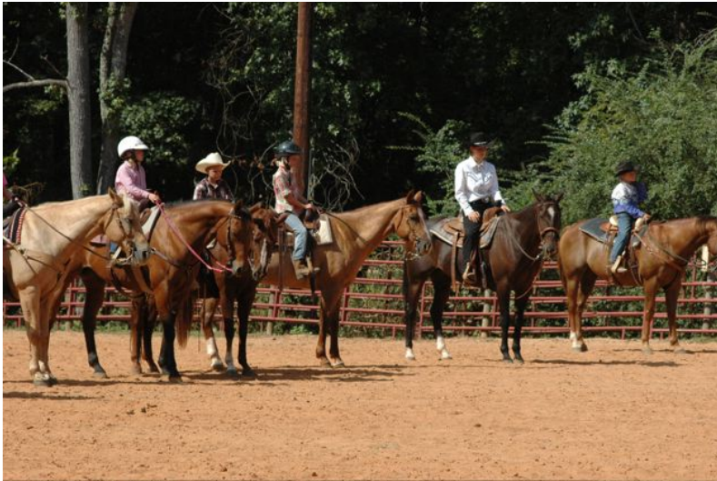
TW Quarter Circle Horse Show and Gymkhana

There is also a Japanese lady who will be coming here to attend the regular horsemanship sessions in October. Greenville seems to be becoming an international city. We have horsemanship students from different countries to whom we have been able to minister and witness, not only Germany and Japan, but we also had a family from Syria. Now there is a girl in England who plans on coming to camp this next summer. We have had local folks bring their grandchildren for summer camp from as far away as Michigan and Colorado. Because of horses, and how “everyone wants to be a cowboy,” we have opportunity to reach people who were pretty much unreachable before.