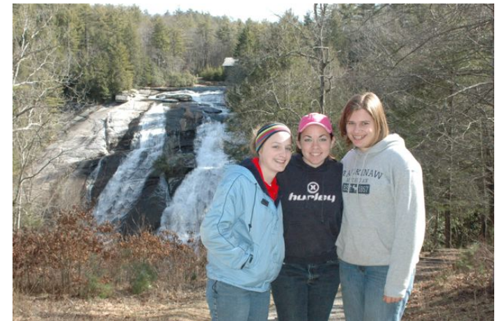
BJU wranglers at High Falls in January