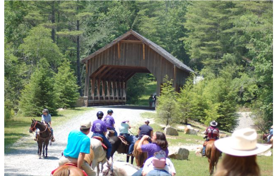
Covered Bridge at DuPont State Forest